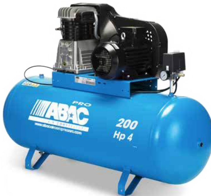
PRO B4900 200 FT4 4 hp, 200 litres