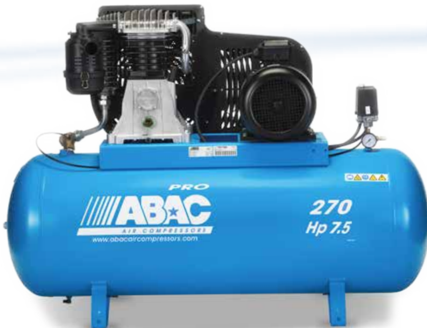
PRO B6000 270 FT7,5 7,5 hp, 270 litres

Finned aftercooler to lower the compressed air temperature